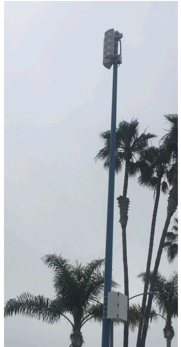
GENASYS VOICE SIREN - WEST JETTY PARK INSTALLATION